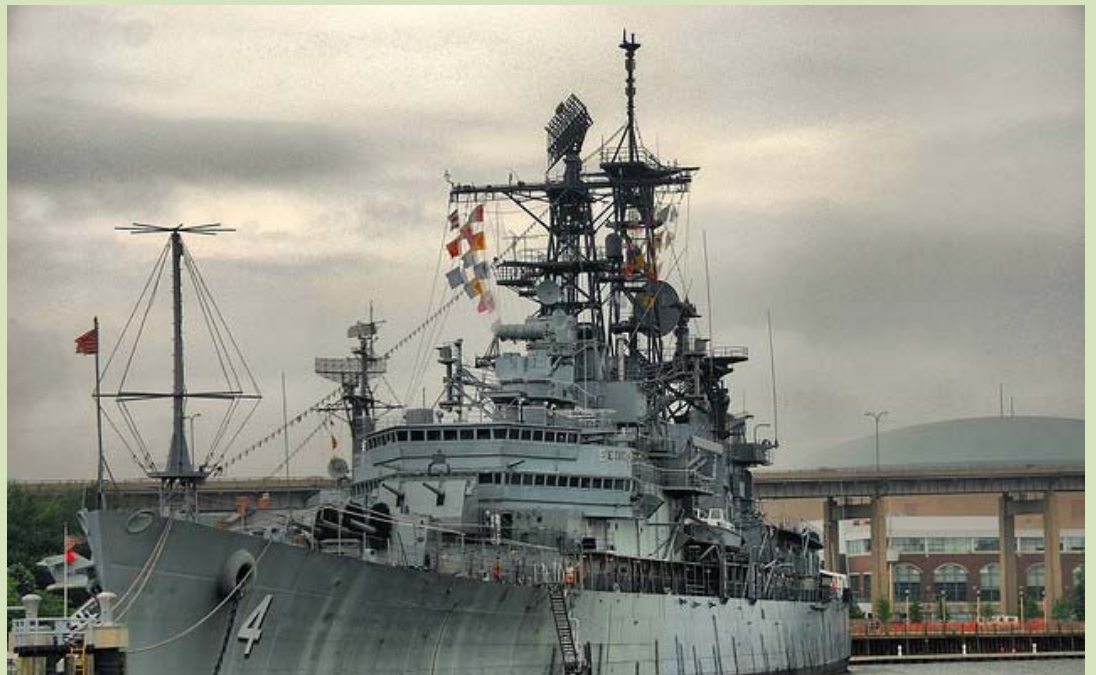
USS Little Rock at the Buffalo & Erie County Naval & Military Park – Location of Friday Night Picnic