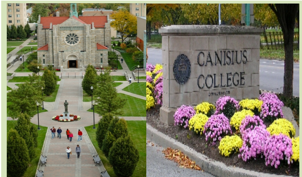
Canisius College Campus, Buffalo, New York – Location of Workshops and Dorm Accommodations