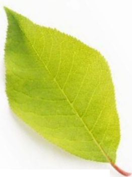
Canada Red Chokecherry