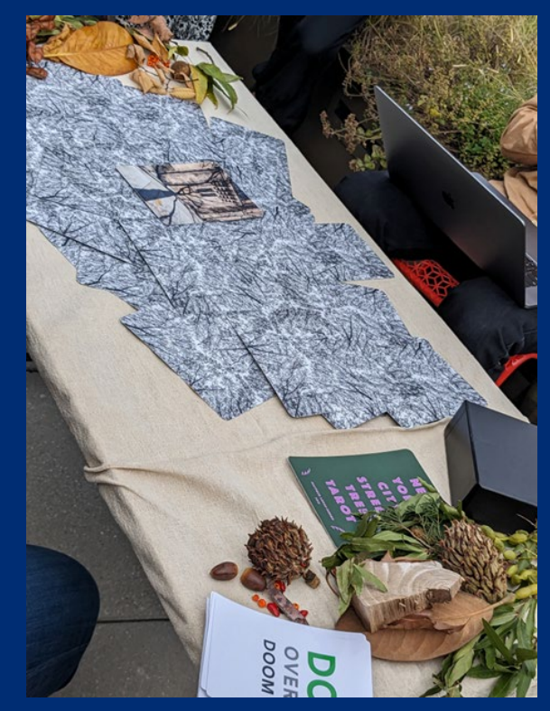
Tree Tarot demo